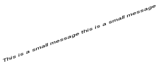
Fig. 4.2 Skewed Printed text document