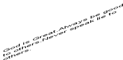
Fig. 4.3 Skewed Printed text document